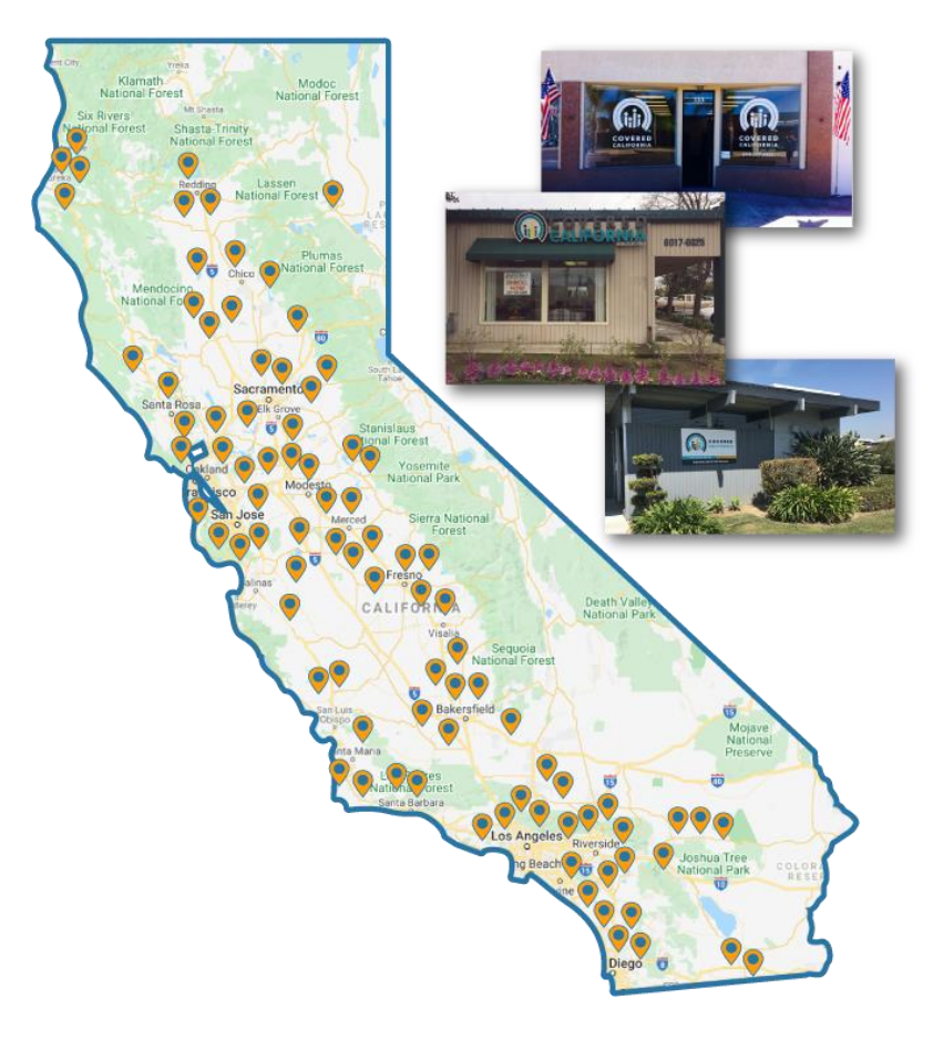
Figure 3: Covered California's Over 500 Licensed Insurance Agent Storefront Locations Across the State

In addition to signing up consumers through their own through the website, Covered California also partners with certified and licensed enrollers who provide free and confidential help throughout the state. Covered California works with more than 11,000 Licensed Insurance Agents, who have established more than 500 storefronts in communities across California.