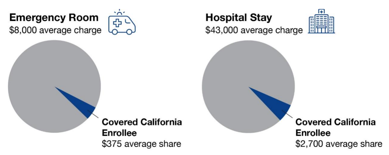
Figure 1: Covered California Enrollees Save when Visiting the ER or Hospital

Similarly, while fewer than 3 percent of Covered California enrollees were admitted to the hospital, the average overall charge for the admission was $43,000, but of those costs, insurance picked up well over 90 percent — leaving enrollees responsible for an average out-of-pocket cost of just $2,700.